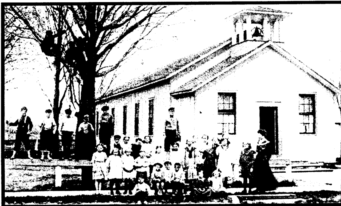
Photo of a school in Montague, Michigan, 1912, courtesy of the Archives of Michigan, Lansing.